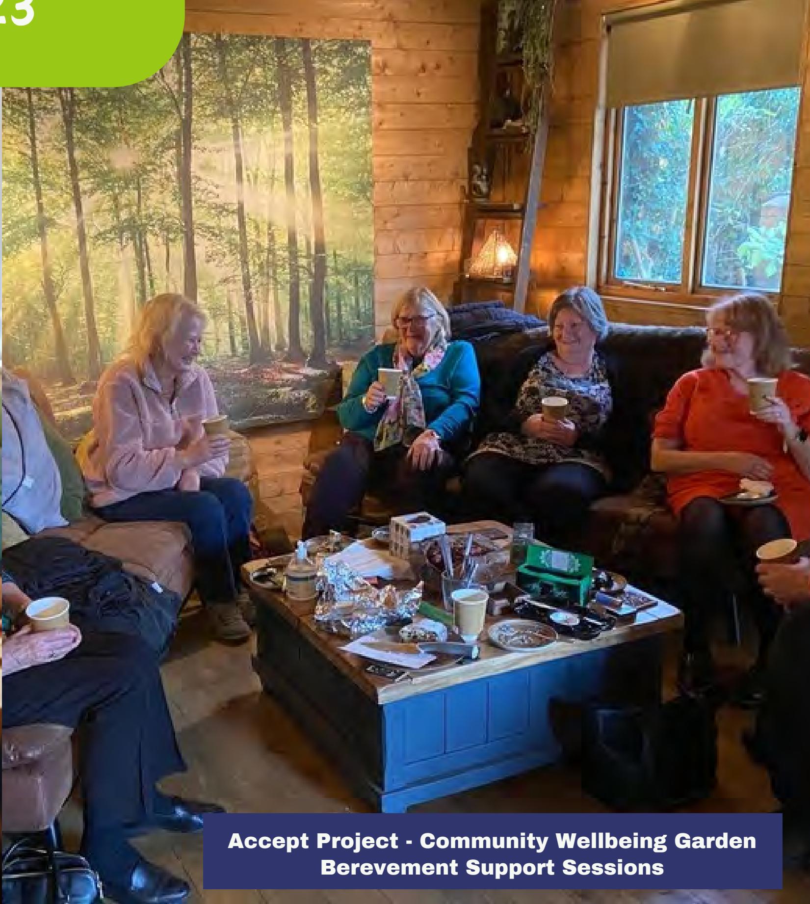
Accept Project - Community Wellbeing Garden Berevment Support Sessions