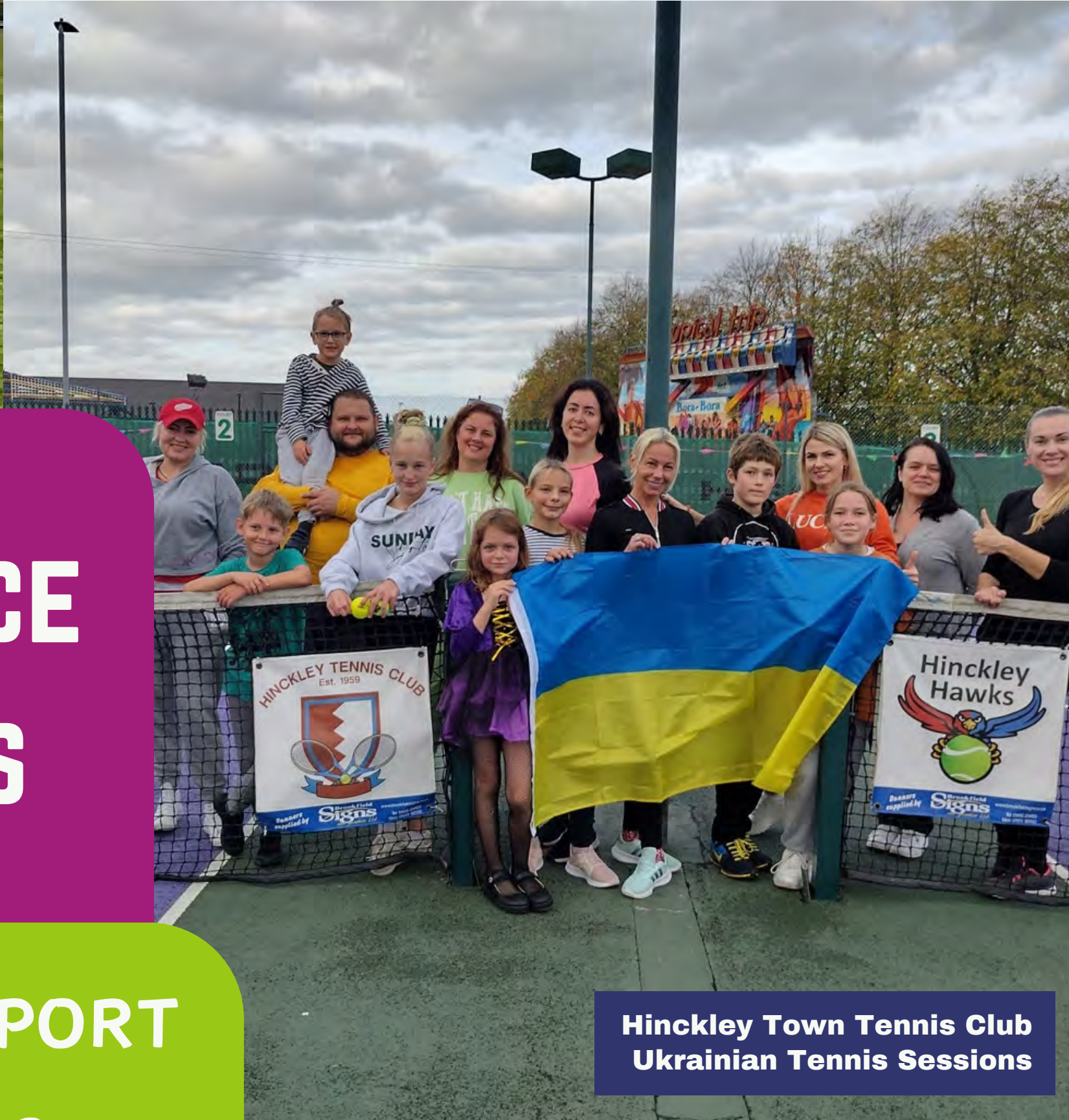
Hinckley Town Tennis Club Ukrainian Tennis Sessions