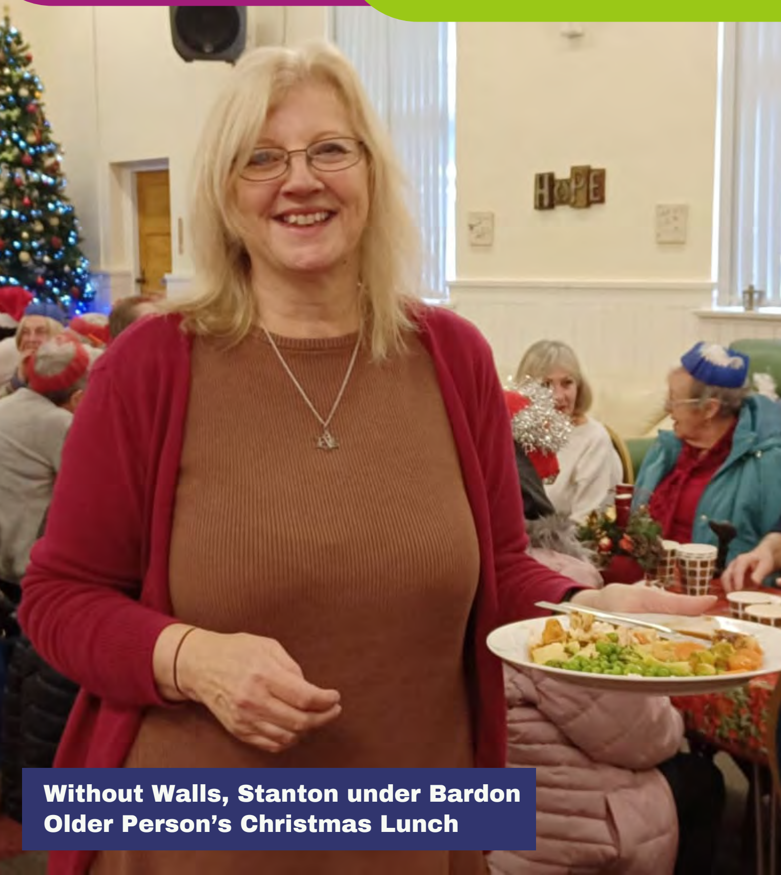
Without Walls, Stanton under Bardon Older Person's Christmas Lunch